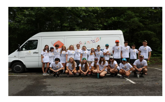
BRUTON PARISH Williamsburg, Virginia