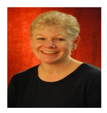
Spotlight on Staff