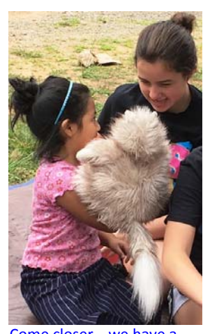
Come closer—we have a secret to share!

site. And yet, these precious children, who literally have nothing, emerged full of energy, smiles and enthusiasm! The needs at the housing project were different, yet just as pervasive.