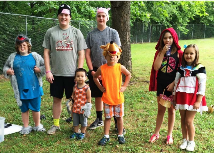
So, we like to play dress up at Camp Craddock...it goes with the story!

Much of the interaction with these marvelous children was one on one. There were many stories read aloud; there were countless piggyback tag games or other outdoor challenges;