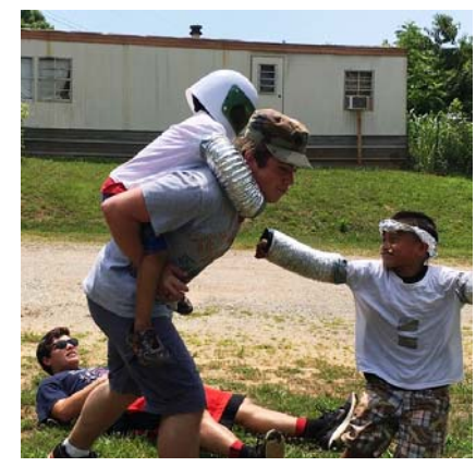
to the need to neutralize robots!

The purpose of our trip was to lead CAMP CRADDOCK, a summer day camp for children of southern Appalachia. We were divided into 2 groups; 10 of us at a housing project, and the other 29 at a trailer park. You might think 29 volunteers at one site would be too many – but we had 60-90 small kids attend every day! On the evening before Well, of course, reading Robot Zot leads each day's camp, we met together in smaller groups to