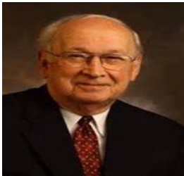
DR.FRED B. CRADDOCK

THIS IS THE SEASON when we are reminded that giving and receiving are one act, not two. Of course, for practical purposes we divide them. For example, there are times when it is important to stress that it is more blessed to give than receive. At other times, attention is given to receiving. The church devotes four weeks (Advent) to prepare to receive the Christ child. But receiving without giving can be selfish, just as giving without receiving can be condescending. The New Testament understands this by offering one word for generosity (giving) and the same word for gratitude (receiving). That word is Grace.