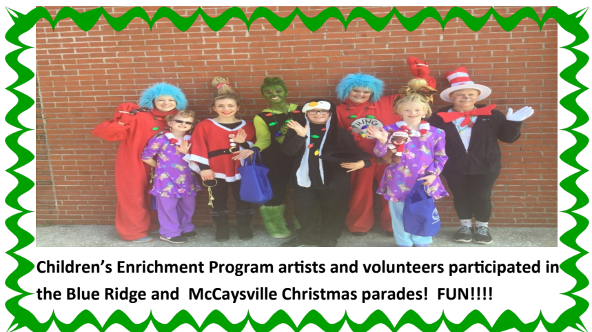
Children's Enrichment Program artists and volunteers participated in the Blue Ridge and McCaysville Christmas parades! FUN!!!!