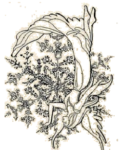
Happy & Hope. We Deliver.

And the angels brought out the blessing box